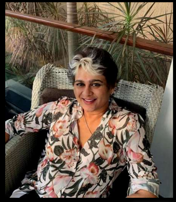
Durga has pledged to grow trees and help protect our mother earth