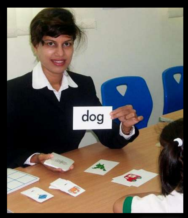
Remediana has pledged to grow trees and help protect our mother earth