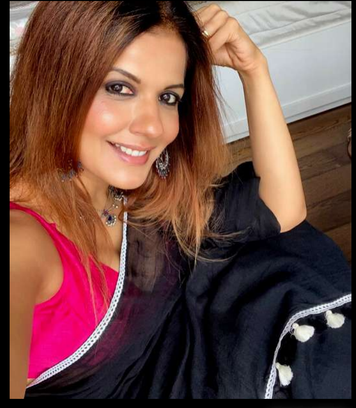
Mumtaz has pledged to grow trees and help protect our mother earth