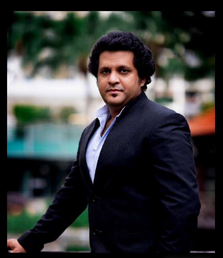
Ganesh has pledged to grow trees and help protect our mother earth