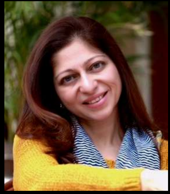
Pinky has pledged to grow trees and help protect our mother earth