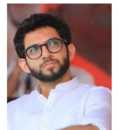
Environment Minister Hon. Shri Aditya Thackeray

Please spread the message with your friends to plant trees online on www.eplantations.in