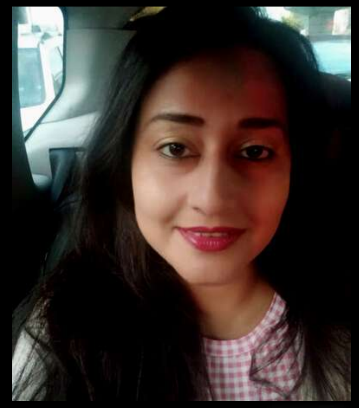
Bhakti has pledged to grow trees and help protect our mother earth