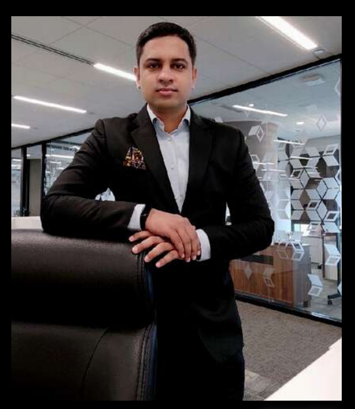
Divay has pledged to grow trees and help protect our mother earth