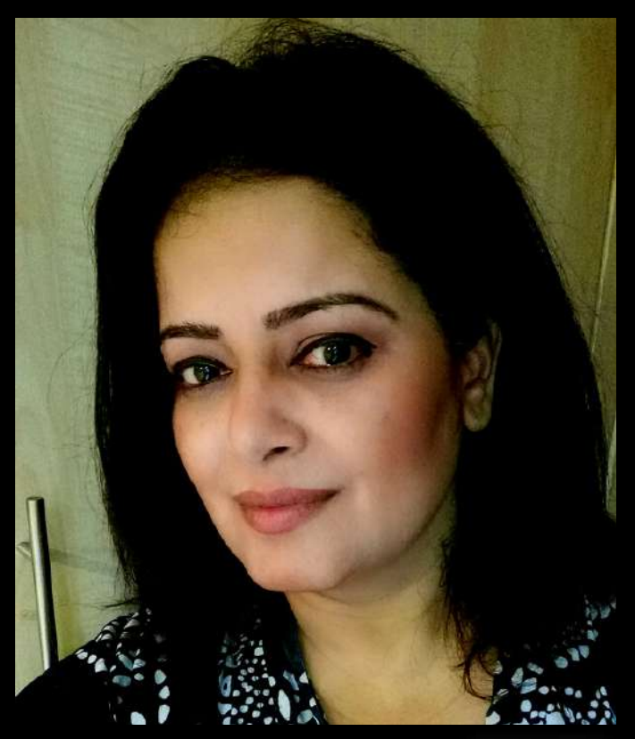
Shabana has pledged to grow trees and help protect our mother earth