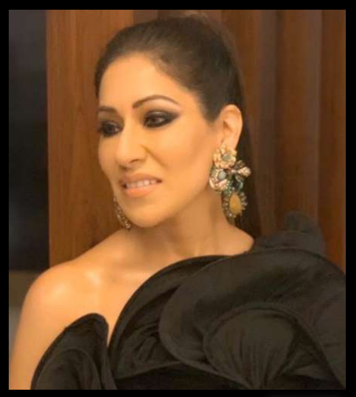
Maheka has pledged to grow trees and help protect our mother earth