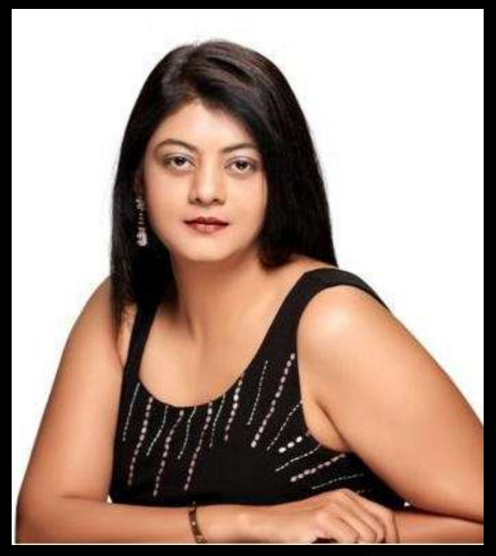
Alpaa has pledged to grow trees and help protect our mother earth

Creates Brand Identity through Product Brochures, Catalogues, Packaging, Sign Boards, setting up of exhibition booths and designing Magazines