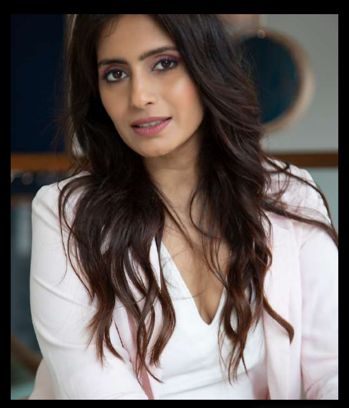
Prernaa has pledged to grow trees and help protect our mother earth