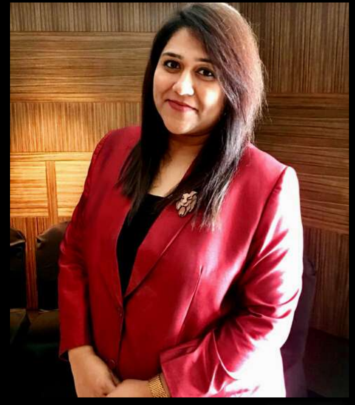
Somali has pledged to grow trees and help protect our mother earth