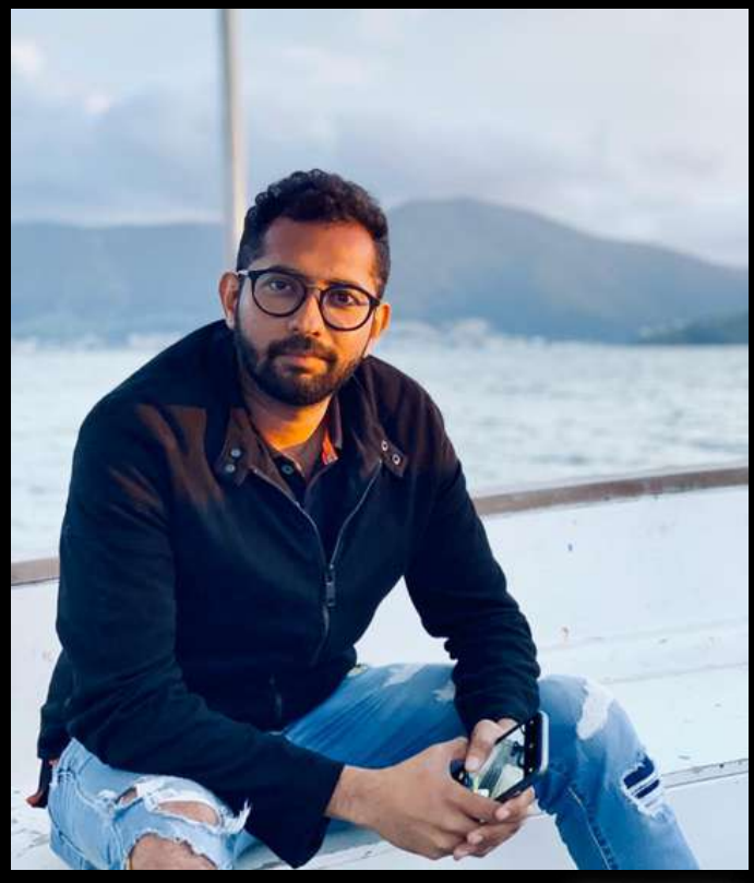
Viral has pledged to grow trees and help protect our mother earth