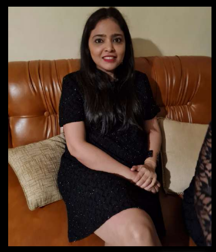
Heeta has pledged to grow trees and help protect our mother earth