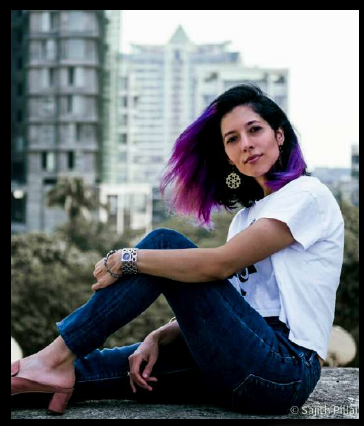
Kaizin has pledged to grow trees and help protect our mother earth