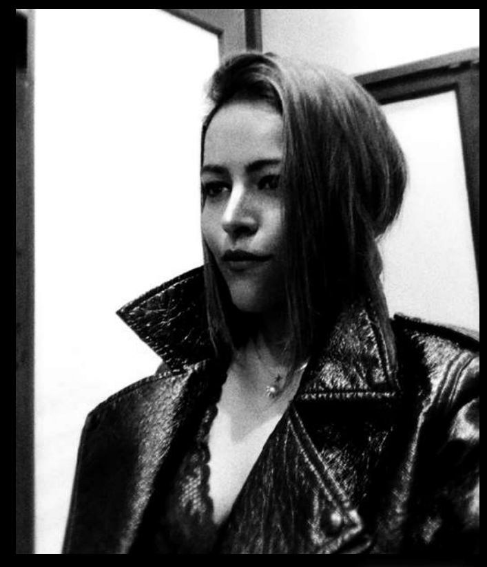
Preanka has pledged to grow trees and help protect our mother earth