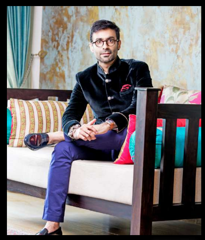
Tarang has pledged to grow trees and help protect our mother earth